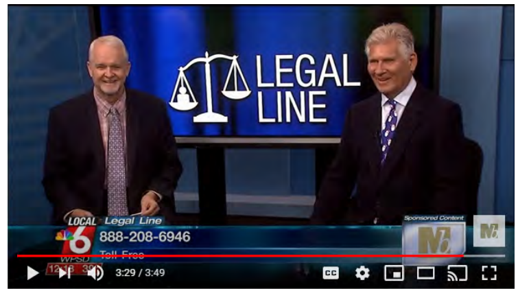
Bryant Law Center is Donating $5000 to Paducah Community Kitchen to Benefit the Homeless and Needy